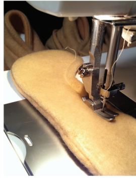
Sew detail stitch.