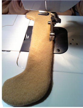
Flip it right side out and sew closed.