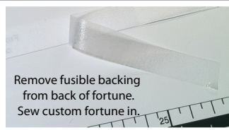
Remove fusible backing from back of fortune. Sew custom fortune in.