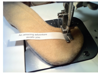
An amazing adventure awaits you.